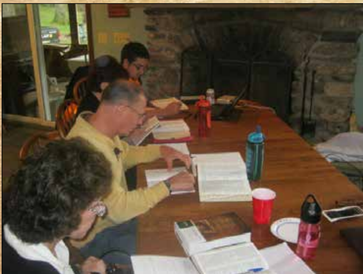
Charis Bible Institute

Grace Prison Ministries partnering with Bible Training Centre for Pastors formed Charis Bible Institute in June 2011 which seeks to extend non-formal theological training free of charge by forming Bible institutes in prisons for those growing to maturity in Christ and have expressed interest in getting training for local church ministry and missionary work aboard. The best pastor, evangelist, and teacher is one who came from that culture and properly trained. We are now extending our service to churches