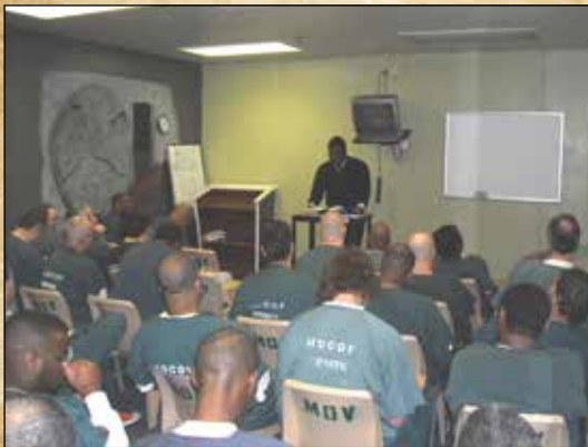
Grace Prison Ministries