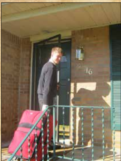
Grace Refuge Transition Facility

In an effort to assist recently released inmates, GPM offers temporary housing, food, clothing, and limited transportation.