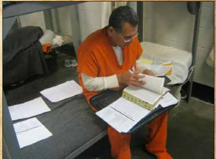
Discipleship by mail

GPM travels to jails, prisons, and youth detention centers throughout the United States; evangelizing individuals with the message of Jesus Christ at four to five institutions per month. This activity is important because the message of Jesus Christ brings hope, forgiveness, and change to those incarcerated. This way, those incarcerated can become law-abiding citizens and good role models in our society. Upon our visits we provide Bibles for those in need of Bibles. In conjunction with the above activities GPM has the following ministries which are designed to bring glory to Jesus Christ and edification to believers: