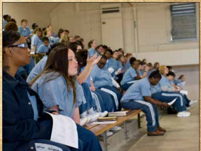
Operation Impact Lives

Operation Impact Lives is a group of believers partnering to impact the lives of prisoners. O.I.L. is comprised of pastors, evangelists, and church leaders. Periodically, conferences are held in prisons, jails and youth detention centers where pastors, evangelists and passionate believers join together to fulfill the great commission (presenting the Gospel and equipping the saints). We take the gospel, sound Bible teaching, and resources to them which gives prisoners hope, purpose, and a new way of thinking.